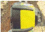
Also available: The Rugby 50 is the tough, maintenance and affordable standard laser level.

The Leica Rugby 55: built watertight for dependable and accurate laser leveling & alignment - rain or shine, inside and out.